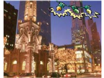
Chicago's Magnificent Mile Lights Festival, November 19

For more information about the above trips or other Generation Tours opportunities, call 1-866-GEN-TURS (1-866-436-8877).