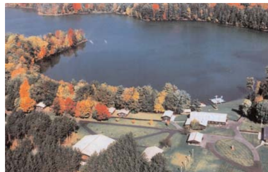
An aerial view of Wisconsin Lions Camp

The popular "A Night on the High Seas" trip is set for November 18-19. Children will visit the Wisconsin Maritime Museum and spend the night on a real submarine, the U.S.S. Cobia. This trip is for children eight to 12 years old and costs $80 per person. You do not need to be enrolled in AFTER SCHOOL programs to attend this trip.