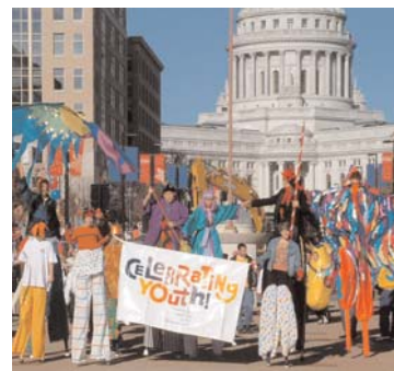
This year's theme is "Circus of Dreams".

The popular event has been staged since 2003 and regularly attracts close to 12,000 people.