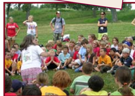
Group games are fun for campers at the camp finale in August.