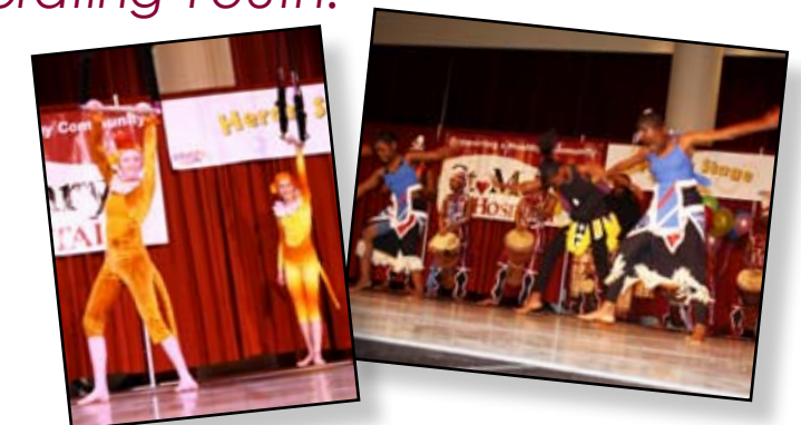
Dance performances by area youth groups are a highlight of Celebrating Youth!