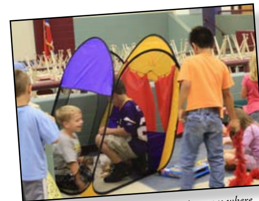
All AFTER SCHOOL sites have quiet areas where kids can read and hang out with friends.