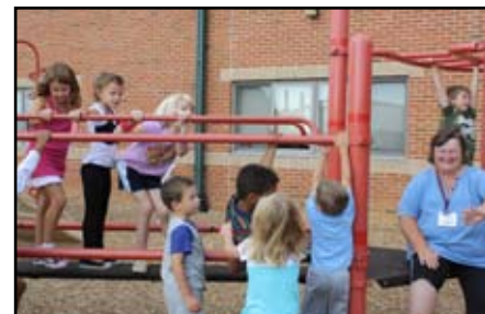
Kids play on the climbing equipment (top) during outdoor time on the playground at Sandhill. Left, dramatic play is fun with a tent.