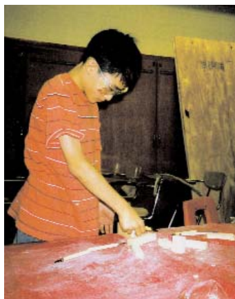
A student works on a woodworking project at a Middle School U course.

Video production has been offered for the past five years at Middle School U. This year it will be run more like a live TV program. The shows developed by participants will be broadcast live on cable TV.