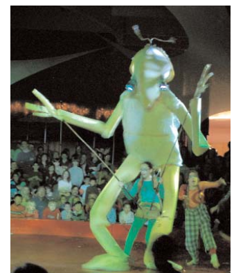
Finale Circus

In addition to being a day of entertainment for kids and families, the event also gives those who offer services and enrichment programs to children and youth a chance to connect.