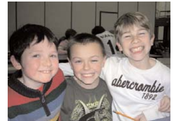
Service projects are fun when you do them with friends.