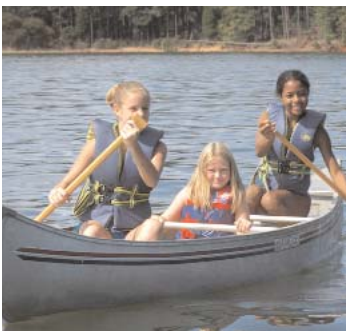
Canoeing is a popular summer day camp activity.