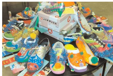
These decorated shoes were part of an art display at a previous fair.

Each fair will also have a silent auction where participants can bid on themed "baskets" based on things like gardening, Bucky Badger, ice cream party or an entertainment package with DVDs, popcorn and other treats. All proceeds go to the scholarship fund.