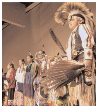
Ho Chunk Dancers at the 2006 Celebrating Youth!