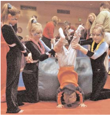
Madtown Twisters at the 2006 Celebrating Youth!