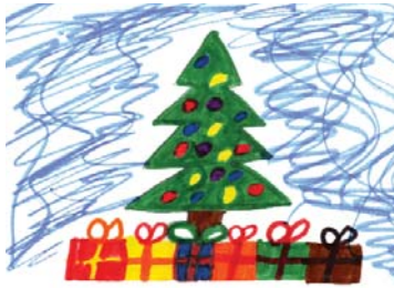
2006 Holiday Card Design by Lauren Tostrud