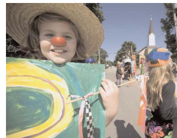
Circus Arts Camp