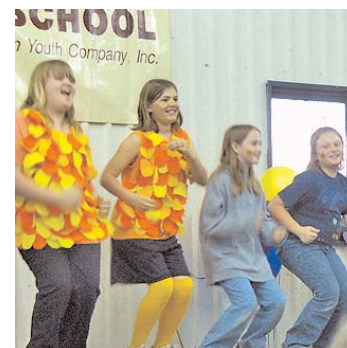
Kids dancing at last year's spring fair in Waukesha.